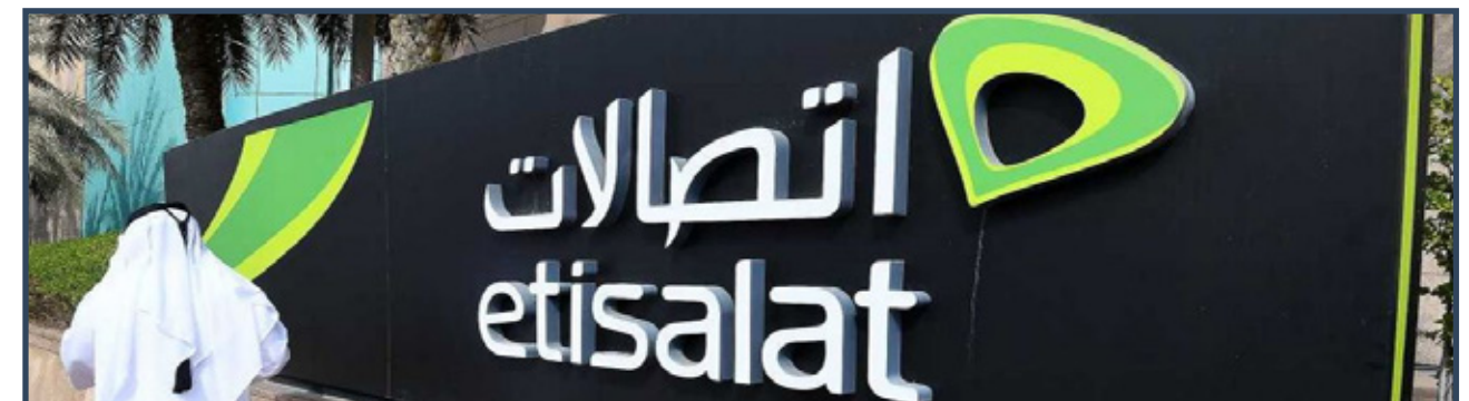
PROJECT: Etisalat, UAE (CCU Works for the Etisalat Data Center)