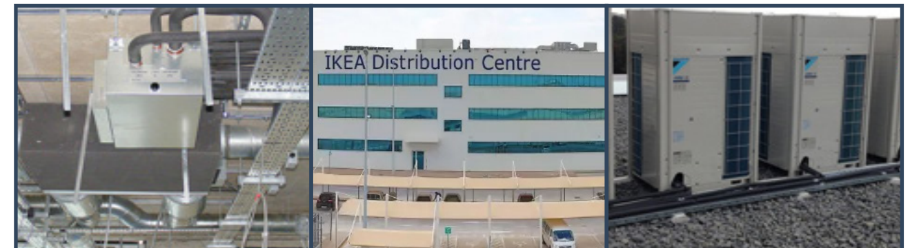
PROJECT: IKEA Distribution Center, Dubai (HVAC Works for the Distribution Center at Jebel Ali)