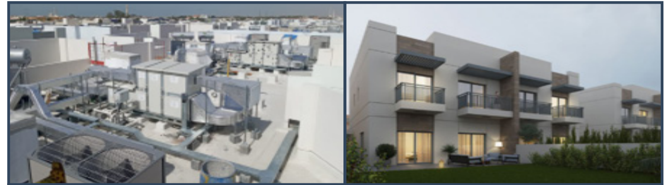
PROJECT: AC Work, Dubai (78 Villa Umm Sequim-1)