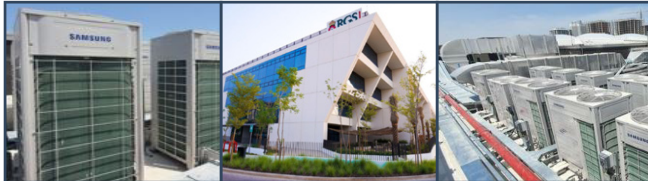
PROJECT: Royal Grammar School, Dubai (HVAC Works for Basement, Ground & 3rd Flr Commercial Building)