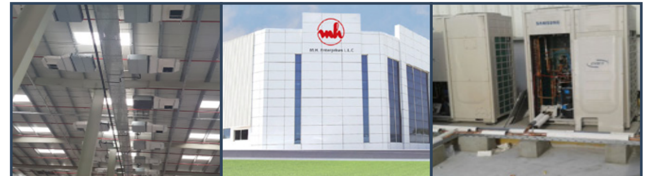
PROJECT: MH Enterprises, Dubai (HVAC Works for Warehouse and Office)