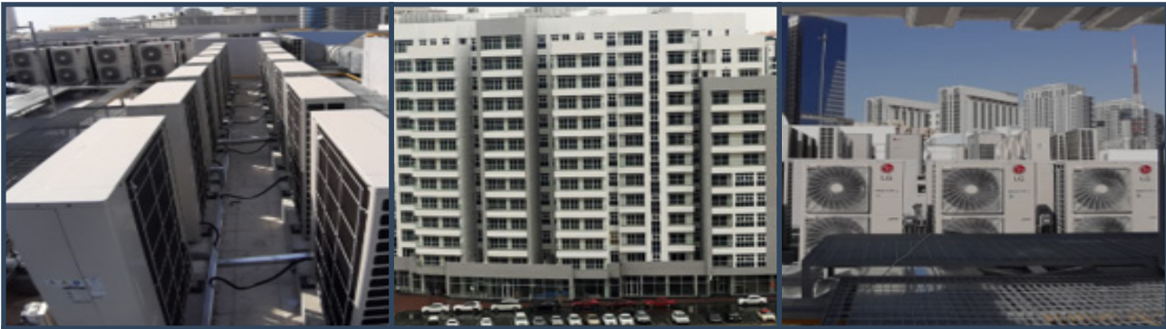
PROJECT: VRF System Work, Dubai (VRF Works for 2B, G & 12 Commercial & Residential Building)