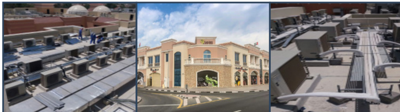
PROJECT: VOLTAS, Al Wasl Road, Jumeirah, Dubai (HVAC Works for Basement, Ground, First & Roof)