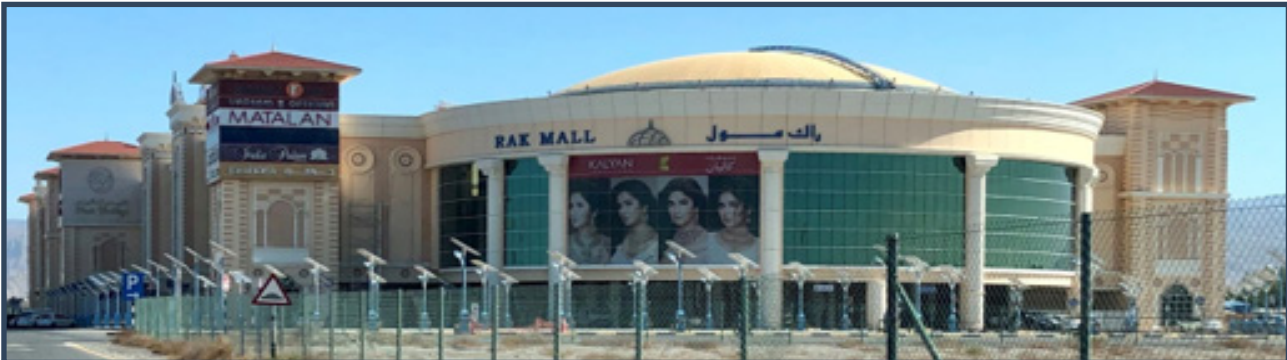
PROJECT: RAK Mall Etx., UAE (290 TR *2, Air Cooled Chillers, Pump Room & associated Chilled Water Piping)