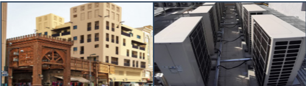
PROJECT: AC Work, Dubai (Souq Al Kabeer Commercial & Residential Building)